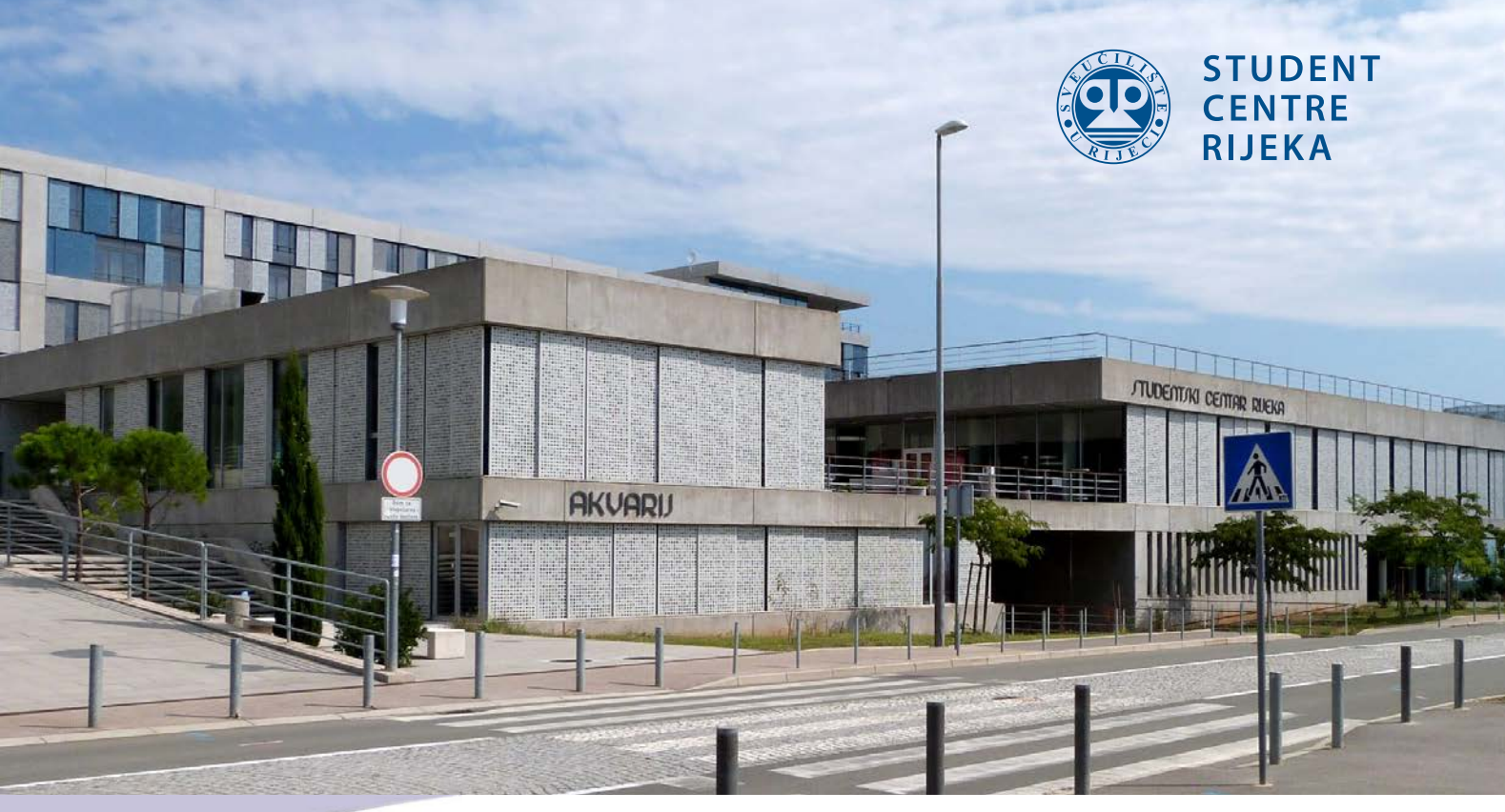
EDITION 2, valid from October 17th 2018