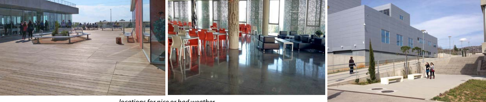
locations for nice or bad weather

We do not rent for political or religious purposes.